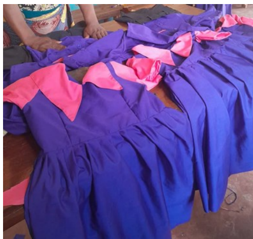
The Sewing Group

As some of you know the kids are not allowed to go to school in Thondwe without a uniform, so each year we send some money to the Sewing Group and ask them to make 10 uniforms for Girls and 10 for Boys, these are then given to 20 kids, whose parents find it difficult to afford the uniforms and so allow them to go to school. This shows this year's uniforms being made.